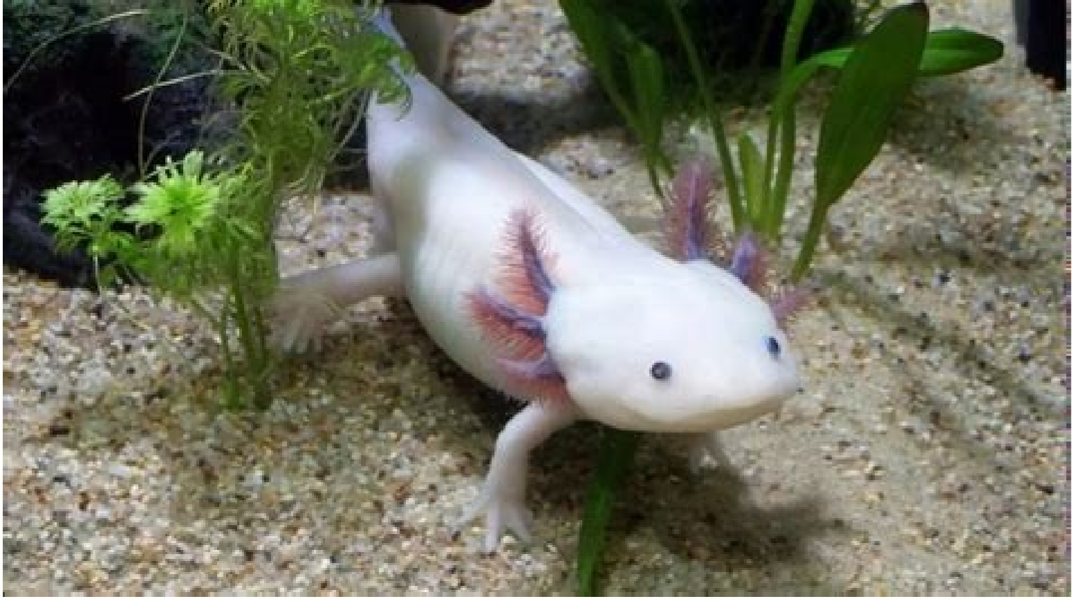
Axolotl special features. Axolotl features. What is an axolotls habitat. Axolotl facts. Information on axolotls.